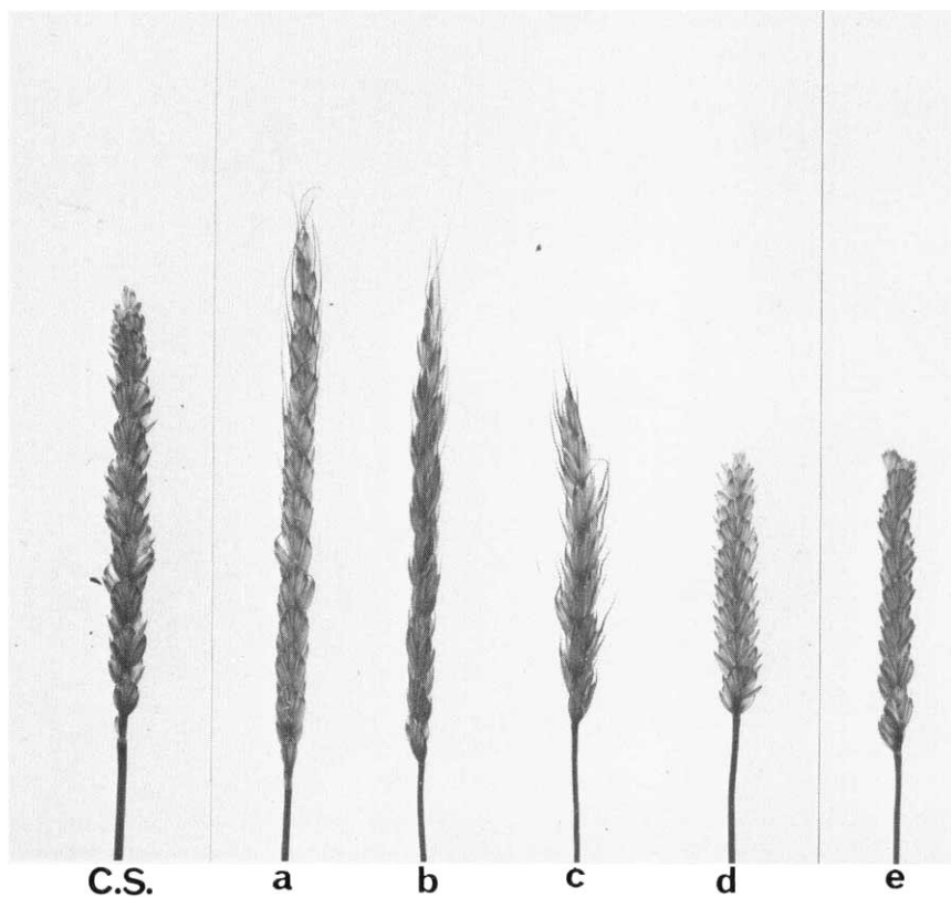
FIG. 2.—Spike morphology of the wheat parent and some wheat \times barley F_1 hybrids, \times 0.57 . C.S., Chinese Spring parent; a, 28-chromosome normal hybrid; b, 31-chromosome hybrid; c, 27-chromosome hybrid; d, 23-chromosome hybrid; e, 21-chromosome “hybrid” (haploid wheat).